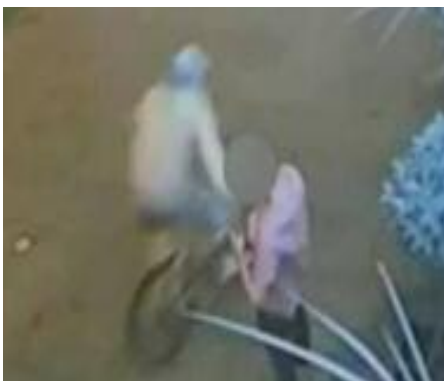
An iPhone robbery in progress

stop these robberies. A team of 12 dedicated officers have in recent months been targeting the suspected offenders. They have been using a whole host of powers such as Stop and Search and issuing penalties for cycling on the pavement.